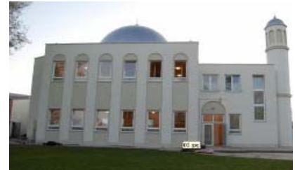
The Fazl Mosque, London , Nusrat Jahan Mosque, Denmark and Khadija Mosque, Berlin

Even though the mosque in Berlin was not built, the wish of Hazrat Musleh Maud to build mosques in Europe was not forgotten. Consequently, in 1957 a mosque was built in Hamburg, East Germany. Astonishingly, this was again built through the contributions by Lajna and Nasirat. Then again in Copenhagen, Denmark another mosque was built in 1967 called Masjid Nusrat Jahan. This was opened by Hazrat Mirza Nasir Ahmad, the third Khalifa of Ahmadiyyat and was again funded through the contributions made by Lajna and Nasirat.